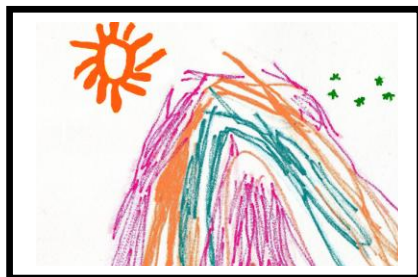
... Sunshine, Rainbow and Stars