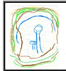
Togetherness... parent and child

Parent Consultation via Telephone: This service is also offered via telephone, for those who cannot come into the office, or who simply prefer this method of consultation. Please call for more details.